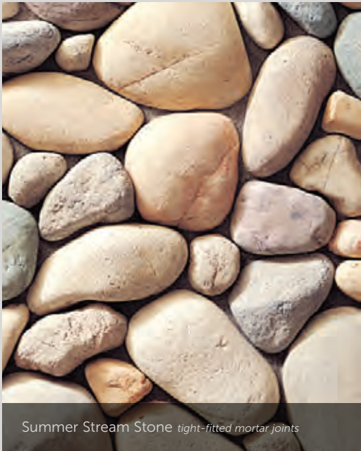
Summer Stream Stone tight-fitted mortar joints