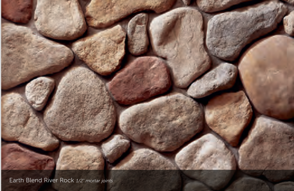
Earth Blend River Rock 1/2" mortar joints