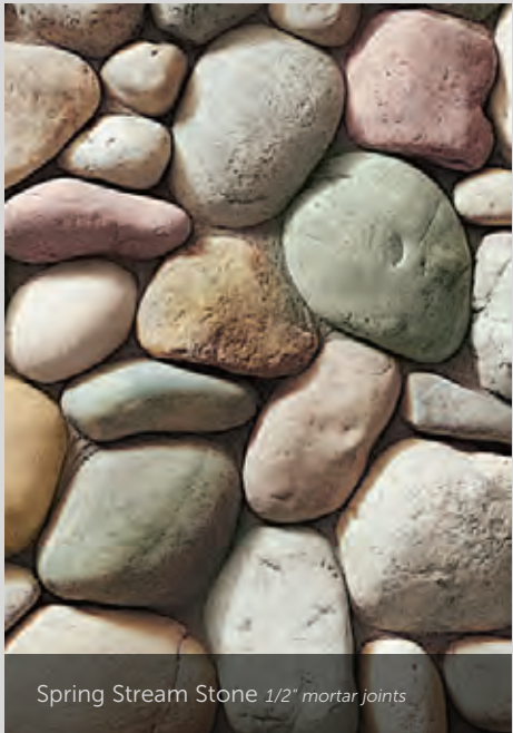
Spring Stream Stone 1/2" mortar joints